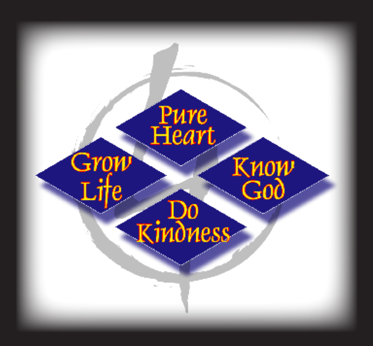
Finding Authentic Kingdom Faith