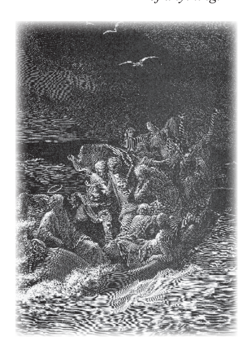
Walking on the water sealed it for the followers of Christ. He was able to do everything in the face of anything.

And they came to the other side of the sea, into the country of the Gerasenes. And when He had come out of the boat, immediately a man from the tombs with an unclean spirit met Him, and he made his home among the tombs. And no one was able to bind him anymore, even with a chain; because he had