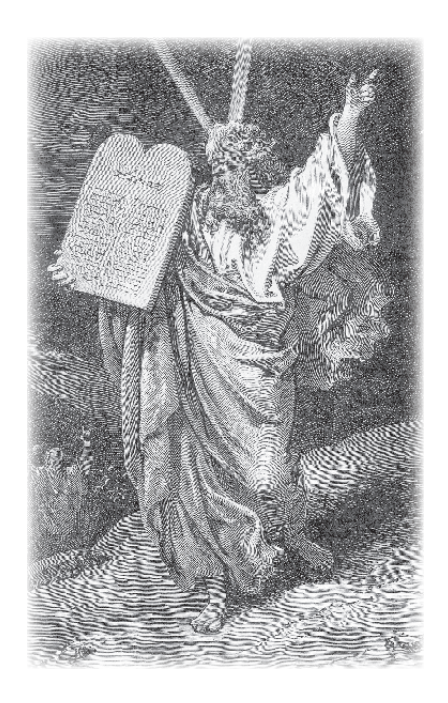
Read Exodus 20 and Deuteronomy 10

The requirements of God's Law were fulfilled by Christ. The Law reveals sin, sin brings death, and Christ conquered death through His submission to the will of His Father. Christ does what is necessary to fulfill the requirements of God's Law: the spilling of blood to pay for sin.